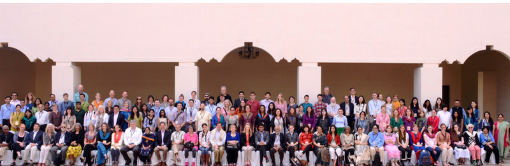
Photo: DDRA Fellows at the Southeast Asia Conference

Reach out to mentors, professors, and advisors both inside and outside of your university and ask them to review your proposal. Ask for feedback on the specific evaluation criteria published by DDRA and ask them to analyze your writing, content, and research specifics when giving suggestions and recommendations for improvement.